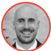
Loyle Campbell Research Fellow, Center for Climate and Foreign Policy