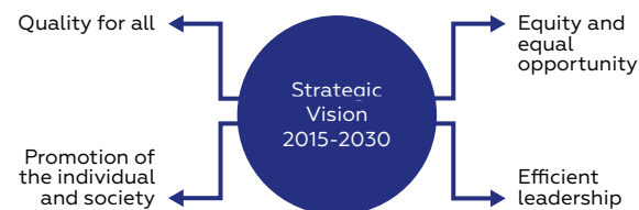
Figure 2: The four areas of the strategic vision 2015-2030 (OCP Policy Center, 2016)